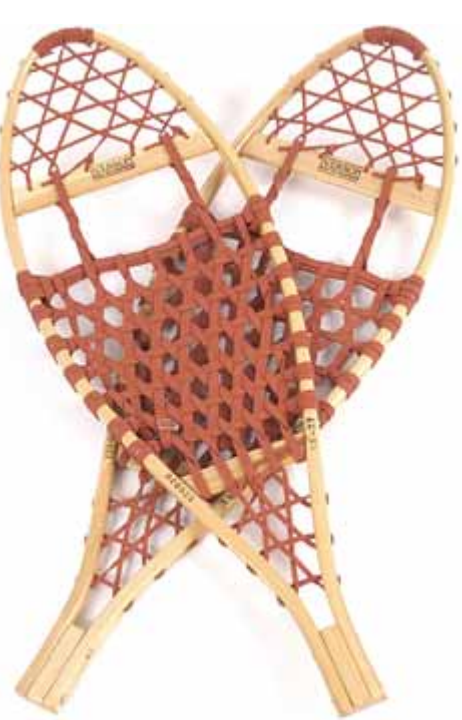
Iverson's Modified Bearpaw is a white ash frame snowshoe available with either neoprene or rawhide lacings. The 12-inch-by-35-inch model supports 200 pounds

Snow conditions matter, too. On fluffy dry powder, you need more float than on the wetter, hard-packed stuff. While all snowshoe manufacturers state the maximum weight a snowshoe is designed to carry, only some specify whether this applies to powder or hard-packed snow. If the manufacturer doesn't rate a snowshoe for the type of snow, you should ask before you buy.