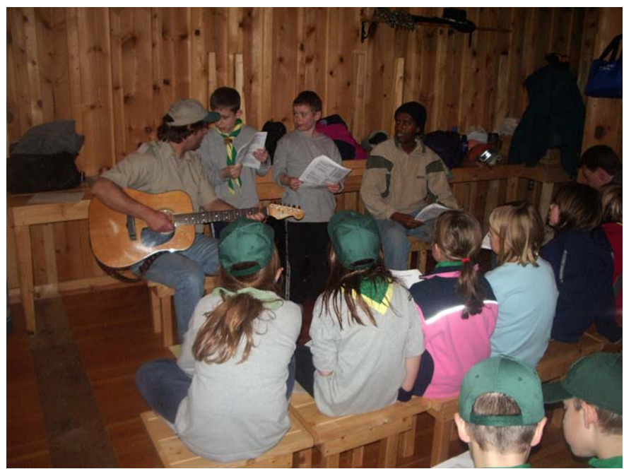
Bagheera plays guitar while Ahmed and the Timberwolves decide which song to sing next.

Everyone had a wonderful time and we are all looking forward to our next Winter Camp at the end of January. Who knows what wildlife we might see next time!