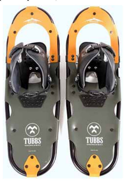
(Left) The Tubbs 25-inch Altitude series supports 120 to 200 pounds and costs $229. (Right) The 25-inch Pinnacle series is designed for day hikers covering moderate to steep terrain and costs $249.