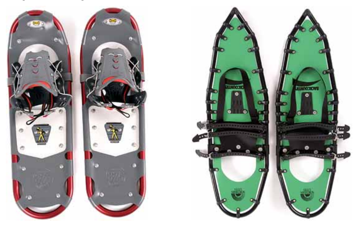
(Left) The Atlas snowshoe 8 series is designed for moderate to steep terrain. The 30-inch model, $179, supports 170 to 250 pounds. (Right) The Northern Lites Backcountry, $229, supports 175 to 250 pounds and uses spacecraft aluminum frames.

If you are planning big mileage trips, snowshoe weight is important. Check out Northern Lites, which uses spacecraft-grade aluminum to make snowshoes that are only half as heavy as the average. Their Elite model (which holds up to 175 pounds) weighs in at a remarkable 35 ounces for the pair; the Backcountry, at 43 ounces, can take up to 250 pounds and is appropriate for mountaineering and backpacking. Their less expensive Quicksilver series is still lightweight but designed for less rigorous recreational use. (www.northernlites.com)